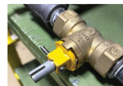
Figure 5 - Valve Stem with Nut and Bolt (View 2)