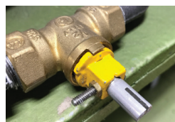
Figure 4 - Valve Stem with Nut and Bolt (View 1 - Showing Nut)