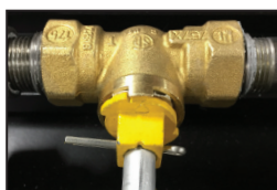
Figure 2 - Valve Stem with Cotter Pin in Un-locked Position