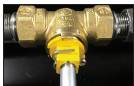
Figure 1 - Valve Stem with Cotter Pin in Locked Position