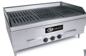
E2436 Electric Broiler

Prepare a perfectly branded hamburger in 4 minutes or charbroil an 8 ounce refrigerated strip sirloin in as little as 7 minutes! Compare this to any competitive 36" model, and you'll see why EmberGlo® offers more production capacity in the same amount of floor space. Any foodservice operation, no matter what size, can install a dependable and profitable charbroiling system in an area as small as 12" wide. Yet the same basic system can be expanded to fit a space of two, three or more feet wide for larger restaurants and chain operations. Whether you want to increase your broiling in a big way or just add a little variety to your menu, there is a place in your operation for the, heavy duty, E24 Series Electric Broiler from EmberGlo®.