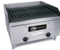
E2424 Electric Broiler