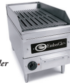
E2412 Electric Broiler