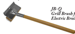
JB-Q Grill Brush for Electric Broiler