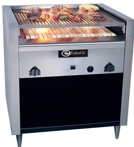
Floor Model - 41F Open Front

Installation and Service Manual - 8448-24 Date Code - September 1959 (Supersedes EMB28 Replacement Parts List for Open Hearth Broiler Model 41)