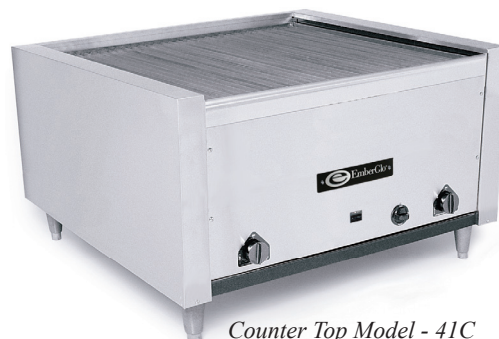
Counter Top Model - 41C Closed Front