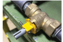
Figure 5 - Valve Stem with Nut and Bolt (View 2)