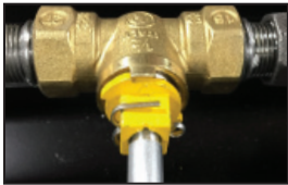
Figure 1 - Valve Stem with Cotter Pin in Locked Position