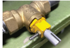
Figure 4 - Valve Stem with Nut and Bolt (View 1 - Showing Nut)