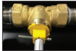
Figure 2 - Valve Stem with Cotter Pin in Un-locked Position