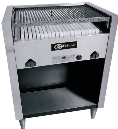
Floor Model - 41F Open Front

Installation and Service Manual - 8448-24 Date Code - September 1959 (Supersedes EMB28 Replacement Parts List for Open Hearth Broiler Model 41)