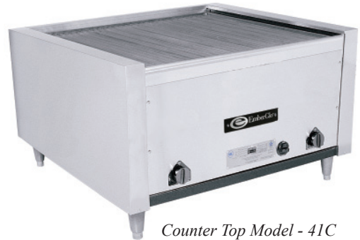
Counter Top Model - 41C Closed Front